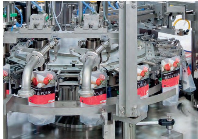
Duplex filling of sauces

Sauces and soups are able to fill hygienically in hot or cold condition in stand-up pouches with or without spout. A format change is easily possible at anytime by using the exchange segments and central adjustment.