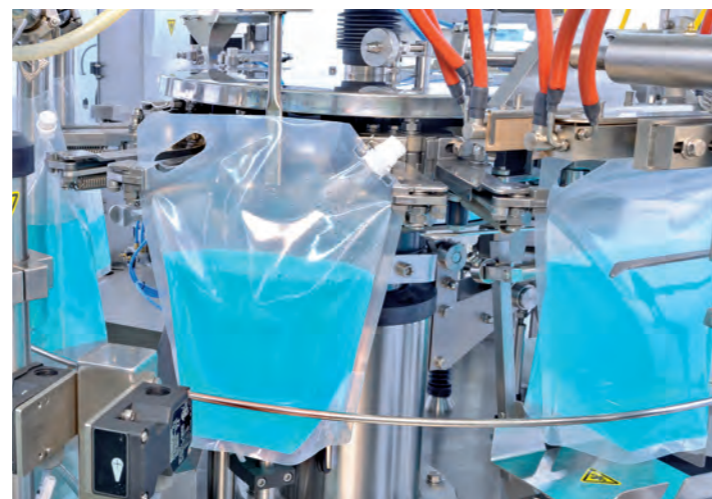
Filling of screen wash into stand-up pouches with corner spout