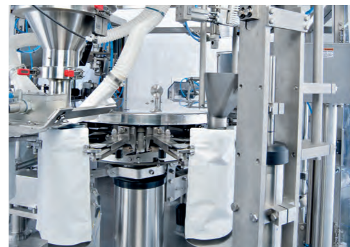
Pouch filling with powder and measuring spoon