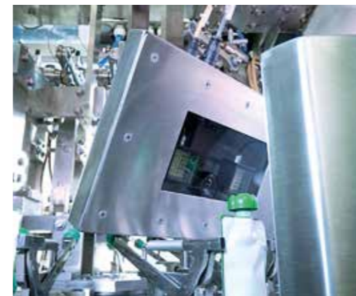
100% control with camera