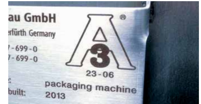
Certified hygiene standard