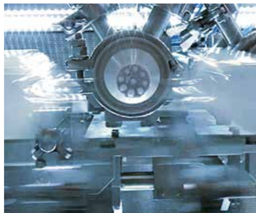
Optimized filling nozzle

Increase your OEE with the support of integrated inspection systems to insure the quality of the packaging. Many different systems are available on the LMS machine.