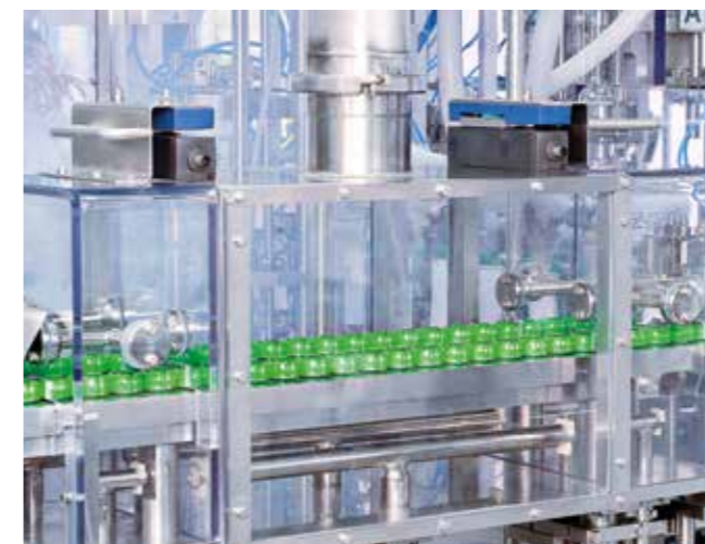
Hydrogen peroxide sterilization of spouts