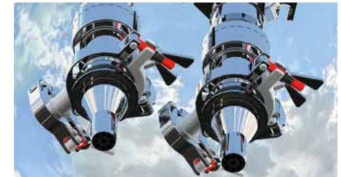
Customer specific filling station